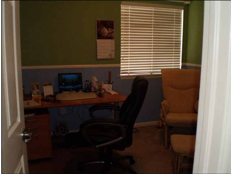
A dark office with your back to the door.

Now that Renee's daughter is five and has a big girl bedroom, Renee is in the process of creating a new office space in the old nursery. At first attempt, she pushed her desk up against the wall, with her back to the door, thus not being able to see any of the energy coming her way. Admittedly she also never opened the blinds, not in her office nor to any window in the whole house.